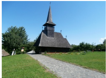
Restored church Negestri Oas