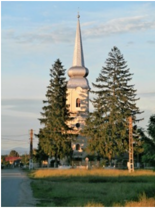
Church at Amati