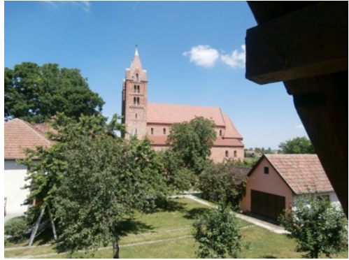
Church at Acas