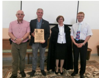
Presentation of plaque