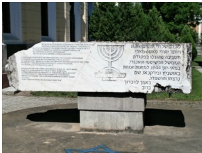
Jewish monument Satu Mare